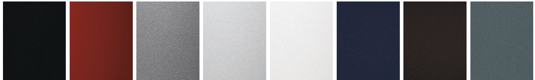
Phantom Black Venetian Red Shale Gray Metallic Symphony Silver Quartz White Pearl Lakeside Blue Dark Truffle (1.6L/2.4L trims only) Nouveau Blue (1.6L/2.4L trims only)