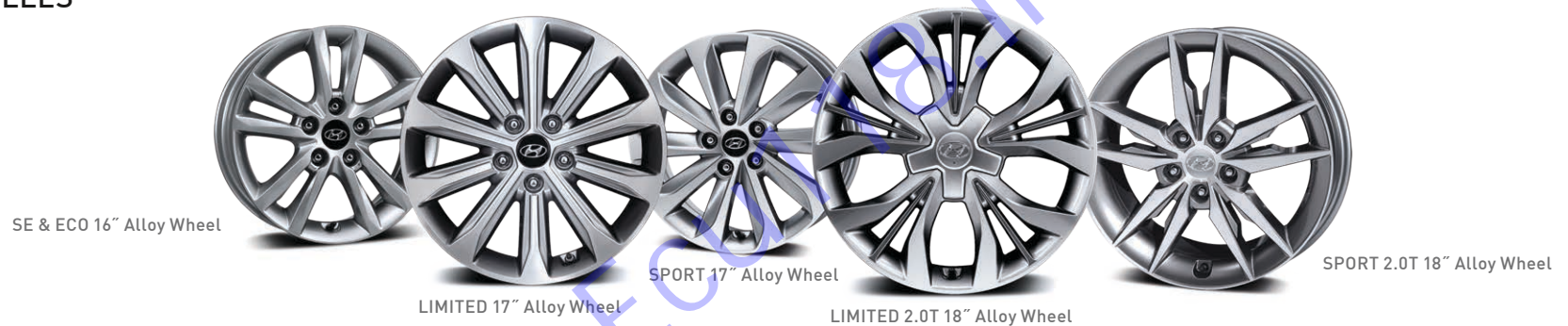
SE & ECO 16" Alloy Wheel LIMITED 17" Alloy Wheel SPORT 17" Alloy Wheel LIMITED 2.0T 18" Alloy Wheel SPORT 2.0T 18" Alloy Wheel