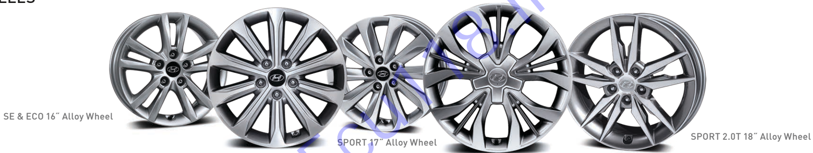
LIMITED 17" Alloy Wheel